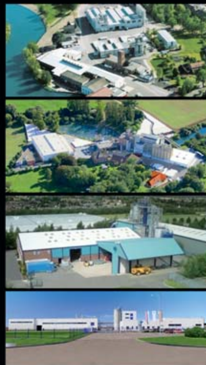
VIATOP® plants Lodenau, Calenberg, UK and Russia

Our fiber expertise, application know-how and innovations gave us the reputation being the number one reliable partner for the asphalt industry for more than 30 years. VIATOP® pellets – our fibers with bituminous coating and additional functional additives inside - for decades have been the benchmark for fiber additives delivering the best quality and functionality for modern asphalt concepts. Together with sophisticated road construction experts around the globe, we developed the innovative VIATOP® plus . A wide range of pelletized fiber additives for various additional functions enhance the properties of the final mixes. Get ready for the future – with VIATOP® plus .